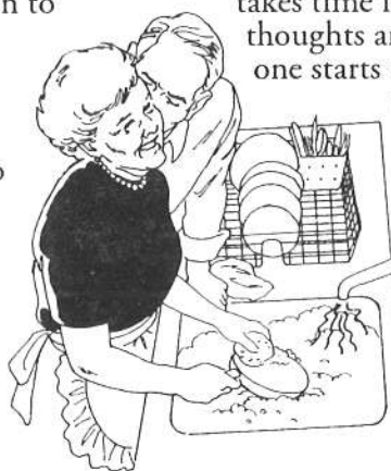
Don't try to talk while the water's running.