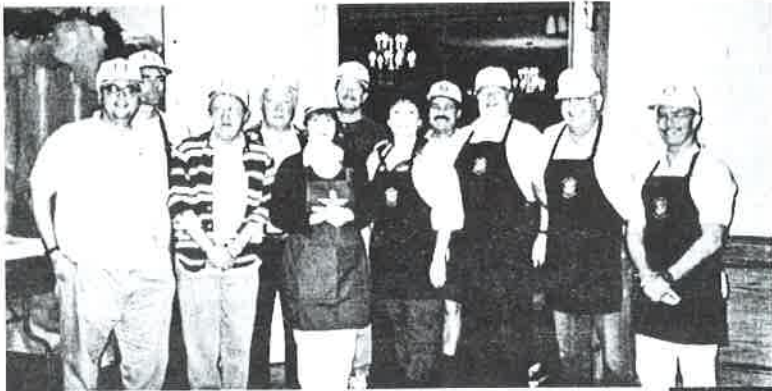
Members of the Marina Rotary Club, chefs extraordinaires, provided a mouth-watering barbecue dinner.

We're so grateful to everyone who helped to make this event the 'best ever.'